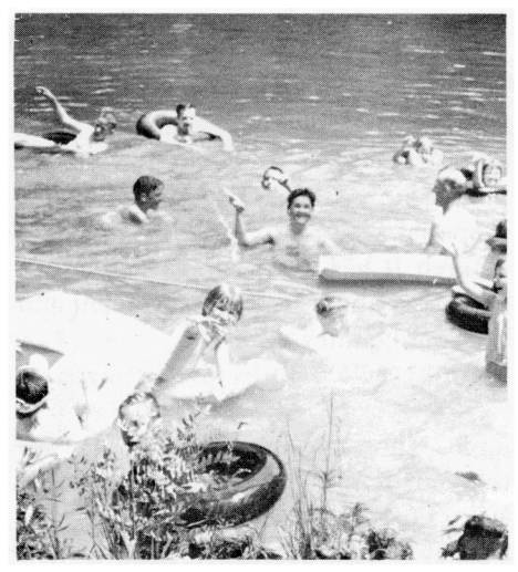
Final Event at Bender Lake

piano,' water-fountain appointment, outstanding speeches and a lively business portion were all contributing factors to a successful meeting.