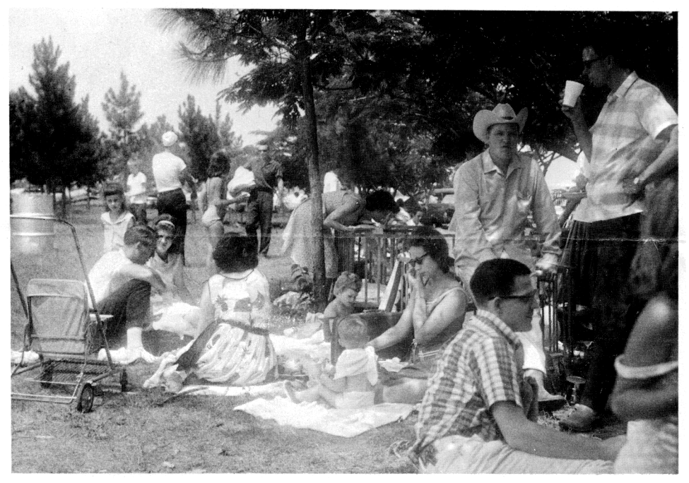
Everyone Takes a Break from the Fast Picnic Pace