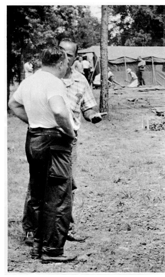
Local Men From Big San

All of these activities provided the perfect background to TEACH BY DO-ING .