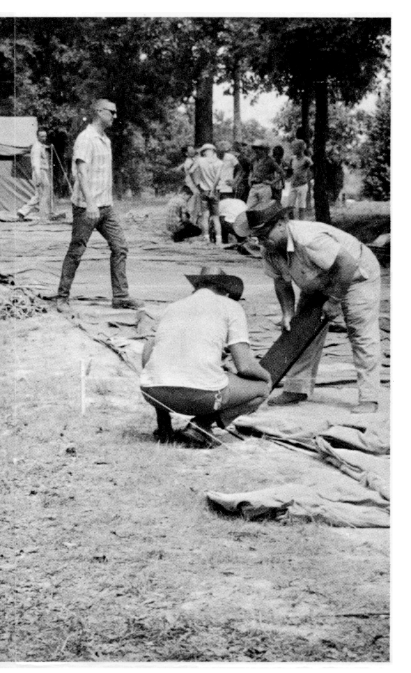
Sandy Ready Boys' Camp

Too soon, the last day dawned and on July 20, we broke camp and loaded up. As the bus rolled along back to the Church grounds, there were many pleasant camp memories. This year's camp has entered the past, but the keen anticipation for next year's high adventure has already started with such words as, "WOW!!! NEXT YEAR, I'LL . . .!"