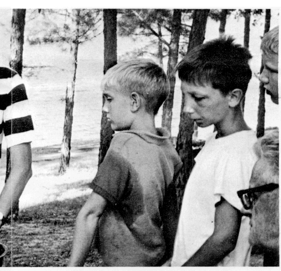
se Pans, Fellows!

Too soon, the last day dawned and on July 20, we broke camp and loaded up. As the bus rolled along back to the Church grounds, there were many pleasant camp memories. This year's camp has entered the past, but the keen anticipation for next year's high adventure has already started with such words as, "WOW!!! NEXT YEAR, I'LL . . .!"