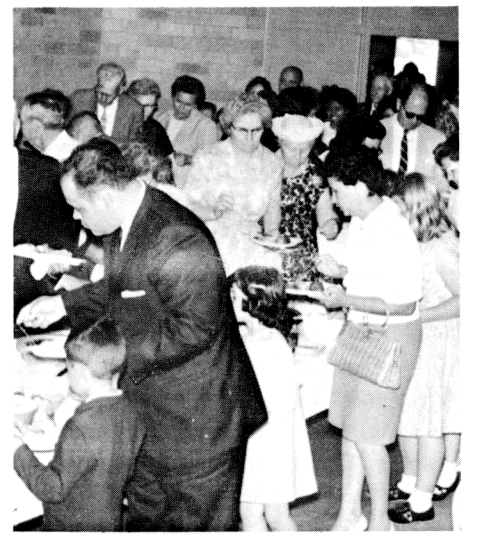
Hungry Brethren Line Up