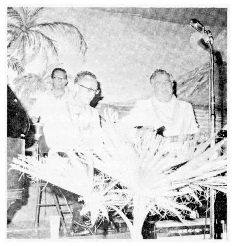
Polynesian Dance in Houston

All guests—wearing door gifts of pretty leis—enjoyed dancing amidst palm trees to music provided by a combo of Houston Church brethren. A "floor show" featuring church talent was the highlight of the unforgetable evening.